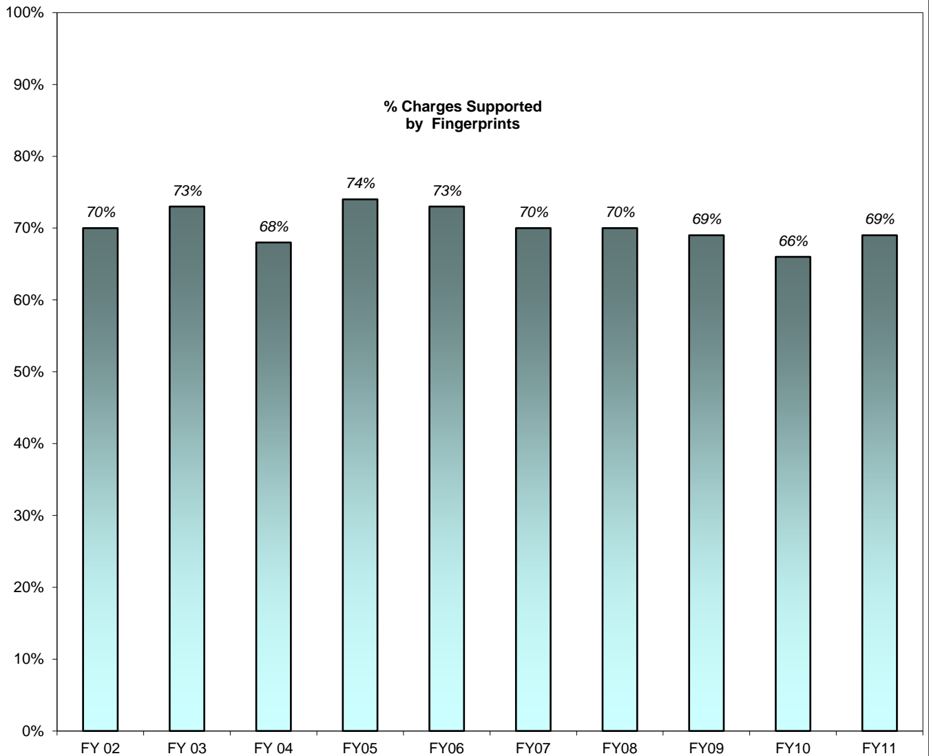
Fingerprint Compliance for APSIN Charges with Dispositions - Page 38