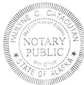
Notary Public My Commission Expires With Office

Subscribed and sworn before me this 21 day of 11 , 20 25