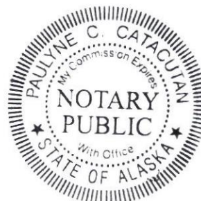
Notary Public My Commission Expires With Office

Subscribed and sworn before me this 08 day of 07 , 20 24