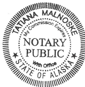
Notary Public My Commission Expires With Office

Subscribed and sworn before me this 30 day of Oct , 20 23