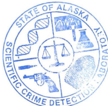
Notary Public My Commission Expires With Office

Subscribed and sworn before me this 05 day of 02 , 20 25