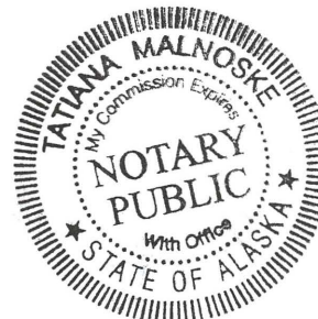
Notary Public My Commission Expires With Office

Subscribed and sworn before me this 30 day of 06 , 20 23