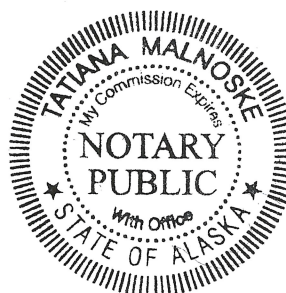
Notary Public My Commission Expires With Office

Subscribed and sworn before me this 24 day of 03 , 20 23