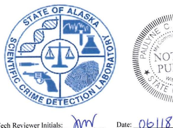
Notary Public My Commission Expires With Office

Subscribed and sworn before me this <u>02</u> day of <u>07</u>, 20 <u>25</u>