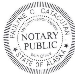
Notary Public My Commission Expires With Office

Subscribed and sworn before me this 26 day of 11 , 20 24