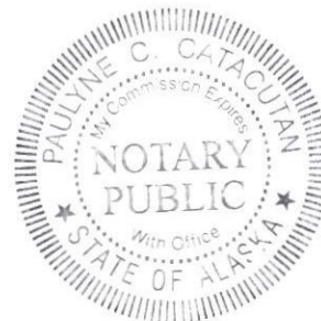
Notary Public My Commission Expires With Office

Subscribed and sworn before me this 21 day of 11 , 20 25