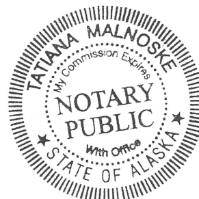
Notary Public My Commission Expires With Office

Subscribed and sworn before me this 23 day of 10 , 20 23