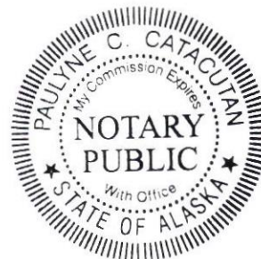
Notary Public My Commission Expires With Office

Subscribed and sworn before me this 24 day of 03 , 20 24 03/24/24 PC