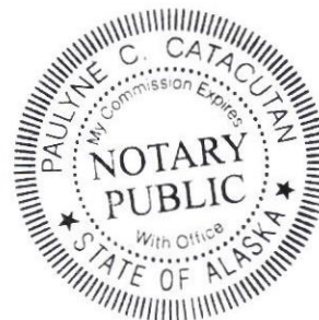
Notary Public My Commission Expires With Office

Subscribed and sworn before me this 26 day of 03 , 20 24