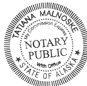
Notary Public My Commission Expires With Office

Subscribed and sworn before me this 10 day of 08 , 20 23