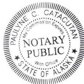
Notary Public My Commission Expires With Office

Subscribed and sworn before me this 22 day of 03 , 20 24