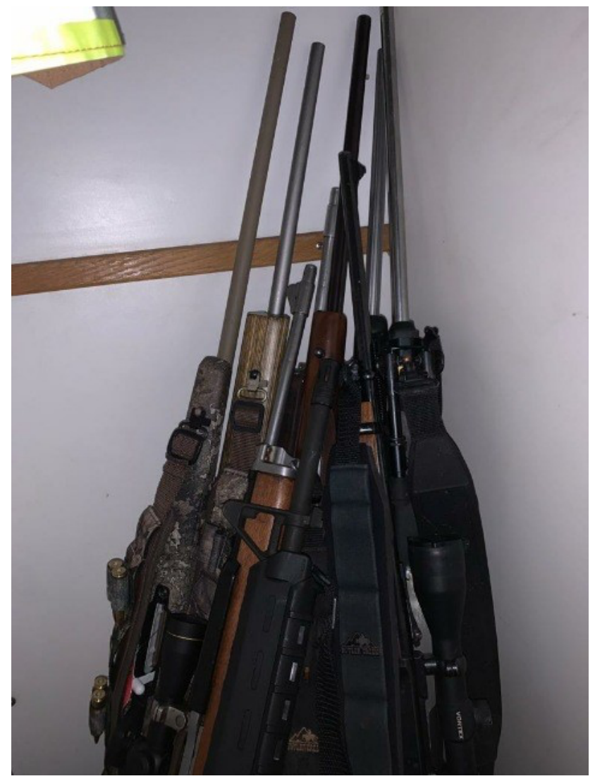
Hunting rifles seized by law enforcement during the operation.