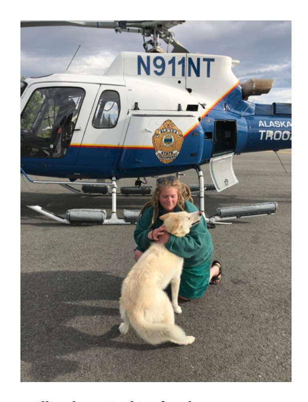
Milling hugs Nookie after they were on both safely transported to Anchorage.