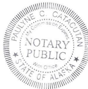
Notary Public My Commission Expires With Office

Subscribed and sworn before me this 21 day of 11 , 20 25