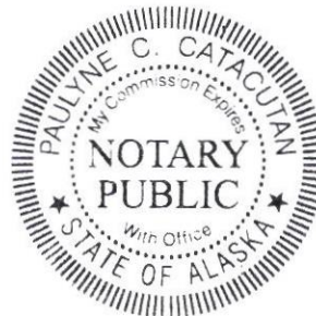
Notary Public My Commission Expires With Office

Subscribed and sworn before me this 26 day of 11 , 20 24