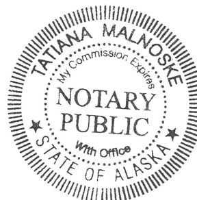
Notary Public My Commission Expires With Office

Subscribed and sworn before me this 23 day of 10 , 20 23